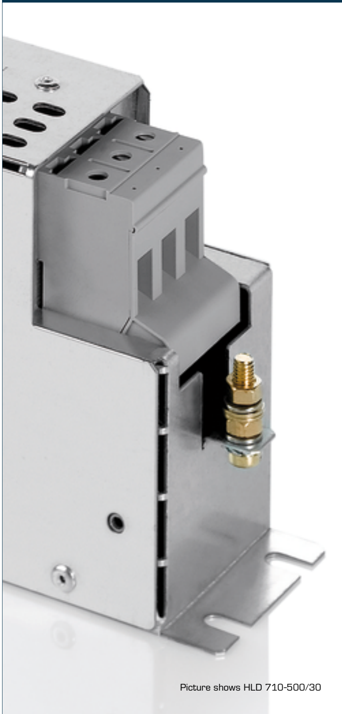
Picture shows HLD 710-500/30